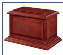
$311 Franklin Cherry Made of: Hardwood Supplied by: Options