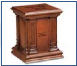
$710 Fredericksburg—Engraved Made of: Hardwood Supplied by: Options