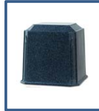
$245 Tribute Burial Urn (P310P) Made of: Synthetic Marble Supplied by: Wilbert-Roland