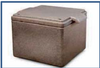
$270 Pebble Core Urn Vault Made of: Composite Plastic Supplied by: Options