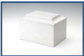
$185 MacKenzie (Various Colors) Made of: Cultured Marble Supplied by: MacKenzie Vault