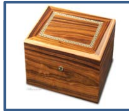
$470 Argus Memory Chest Made of: Rosewood w/inlaid border Supplied by: Wilbert-Roland