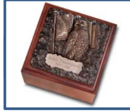
$710 Freedom's Glory Made of: Cast Bronze Supplied by: Options-Discontinued