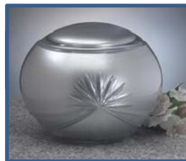
$425 Starlight Silver Made of: Leaded Crystal Supplied by: Aurora