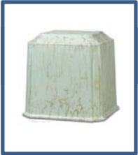
$245 Tribute Burial Urn (P310) Made of: Synthetic Marble Supplied by: Wilbert-Roland