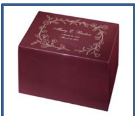
$405 Regal Floral Bronze Chest Made of: Sheet Bronze Supplied by: Options