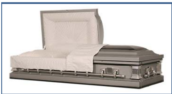
Casket Name: Remembrance-Accord O/S Made of: 18ga. Steel Interior Lining: Pink Crepe Vendor - Thacker Casket Co. Cost: $1,244