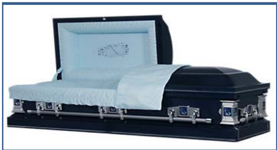
Casket Name: Remembrance-Lord's Prayer Made of: 18ga. Steel Interior Lining: Blue Crepe Vendor - Thacker Casket Co. Cost: $1,244