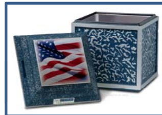
$655 Veteran Triune Urn Vault Made of: Concrete & Stainless Steel Supplied by: Wilbert-Roland