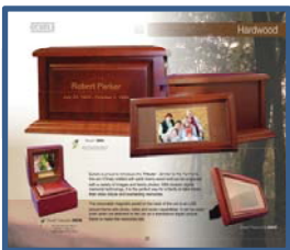
$465 Tribute Video Urn Made of: Cherry Hardwood Supplied by: Ekels