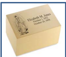
$328 Bronze Chest Made of: Sheet Bronze Supplied by: Options