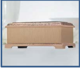
$820 Luxor w/Polished Top Made of: Bronze Supplied by: Aurora