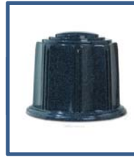
$245 Regal Burial Urn (P300P) Made of: Synthetic Marble Supplied by: Wilbert-Roland