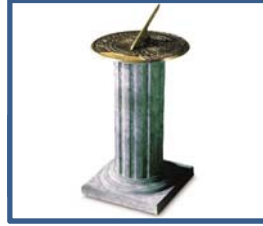
$1,088 Seasons Sundial Made of: Garden Series Supplied by: Options