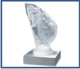
$3,345 Angelic Presence w/ base Made of: Cast Acrylic Supplied by: Options-Discontinued