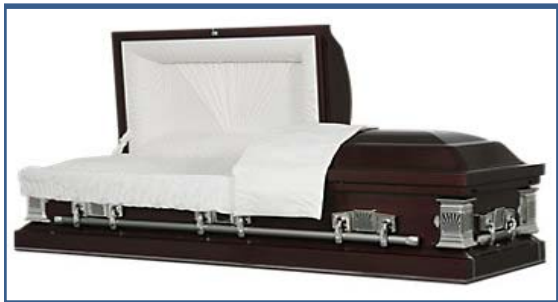
Casket Name: Remembrance-Accent Blush Made of: 18ga. Steel Interior Lining: White Crepe Vendor - Thacker Casket Co. Cost: $1,244