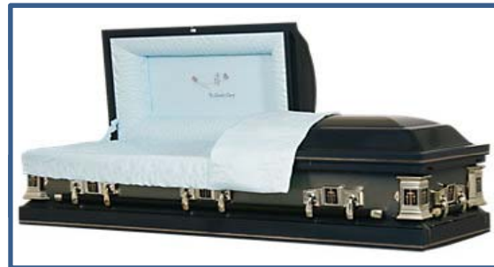
Casket Name: Remembrance-In God's Care Made of: 18ga. Steel Interior Lining: Blue Crepe Vendor - Thacker Casket Co. Cost: $1,244