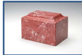
$185 MacKenzie (Various Colors) Made of: Cultured Marble Supplied by: MacKenzie Vault