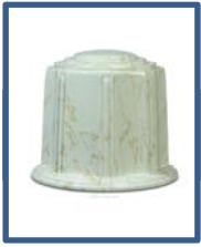
$245 Regal Burial Urn (P300 ) Made of: Synthetic Marble Supplied by: Wilbert-Roland