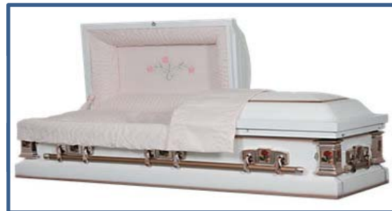
Casket Name: Remembrance-White Rose Made of: 18ga. Steel Interior Lining: Pink Crepe Vendor - Thacker Casket Co. Cost: $1,244