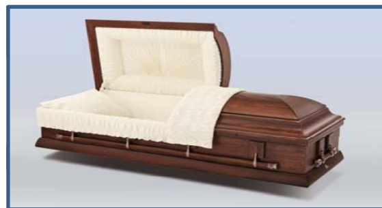
Casket Name: Brockton-Rental Made of: Oak Interior Lining: Rosetan Crepe Vendor - Batesville Casket Co. Cost: $895