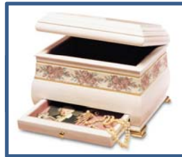
$660 Flora Maple Memento Made of: Maple Hardwood Supplied by: Options